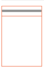
E-COMMERCE WITH POCKET