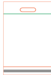
E-COMMERCE WITH DIE CUT